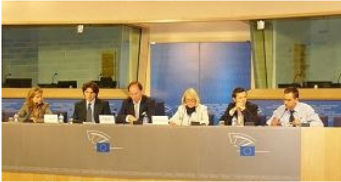
NTDTV, Reporters Without Borders, International Press Alliance, and Members of the European Parliament hold a joint news conference

(Clearwisdom.net) On July 15, 2008, New Tang Dynasty Television (NTDTV), Reporters Without Borders, the International Press Alliance, and Members of the European Parliament held a joint news conference. They condemned satellite company Eutelsat's termination of NTDTV broadcasts in Asia, particularly at this time right before the Beijing Olympics, and asked the European Union and the Government of France to put pressure on the French satellite company to comply with European human rights standards, democracy, and law, and to restore the NTDTV signal as soon as possible. Many officials in the European Parliament and media participated in the conference.